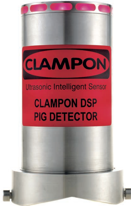
ClampOn Ex ia version.