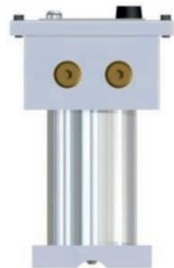
ClampOn Ex dem version.

By using either a dedicated PC with ClampOn software or input to MCS, the user can get a graphic display of the received signal from the PIG Detector. The data output signal can be either analogue 4-20mA or digital RS485.