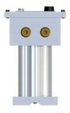
ClampOn Ex dem version.

By using either a dedicated PC with ClampOn software or input to MCS, the user can get a graphic display of the received signal from the PIG Detector. The data output signal can be either analogue 4-20mA or digital RS485.