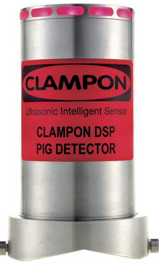
ClampOn Ex ia version.