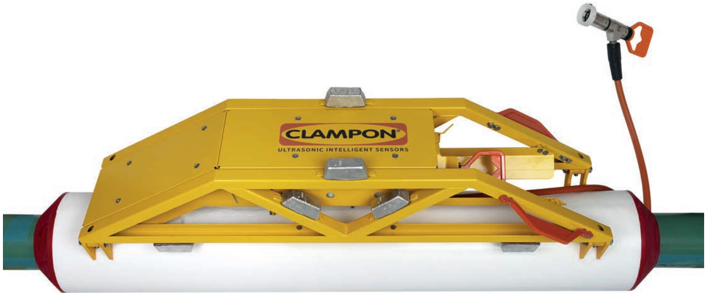
Spool piece with pre-installed ClampOn CEM ® with ROV-installable/retrievable electronics.